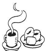
Coffee and Donuts

The Children's Liturgy of the Word is held on Sundays, during the 9:30 am Mass, children in Grades Pre-K through 6 are invited by the priest to come forward to experience the Liturgy of the Word at their own level. They participate in songs, prayers and readings in the area of the church adjacent to the sacristy. The children will return to their seats after the Prayer of the Faithful.