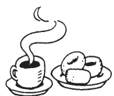
Coffee and Donuts

The Children's Liturgy of the Word is held on Sundays, during the 9:30 am Mass. Before the First Reading, children in Grades Pre-K through 6 are invited by the priest to come forward to experience the Liturgy of the Word at their own level. They participate in songs, prayers and readings in the area of the church adjacent to the sacristy. The children will return to their seats after the Prayer of the Faithful.