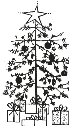
The Giving Tree