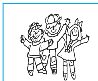
Children's Liturgy of the Word

Parishioners and friends are invited to join us for Coffee and Donuts in the Parish Center cafeteria after the 7:30 am and 9:30 am Masses. Next Coffee and Donuts has been scheduled for Sunday, January 7th, 2018 .