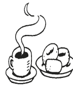
Coffee and Donuts

Miraculous Medal Novena will be held on Monday evenings at 7:30 in the Parish Center Room 8 . Please enter through the double doors at the Canopy Entrance closest to the church parking lot.