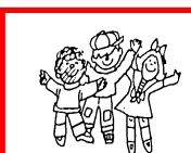
Children's Liturgy of the Word